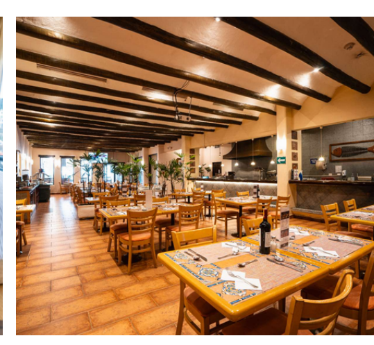
• 3* Superior Ibis Hotel or similar